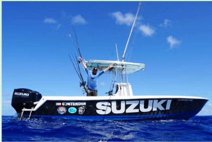
Top Captain with the Scouts - Marshall Ruffo - 25 Tagged