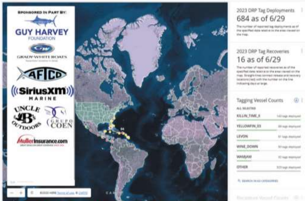
Reported and Received Tagging Progress from 5/30/2023-6/29/2023!